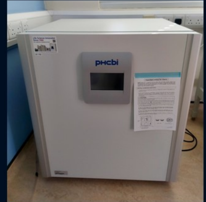
CO 2 Incubator