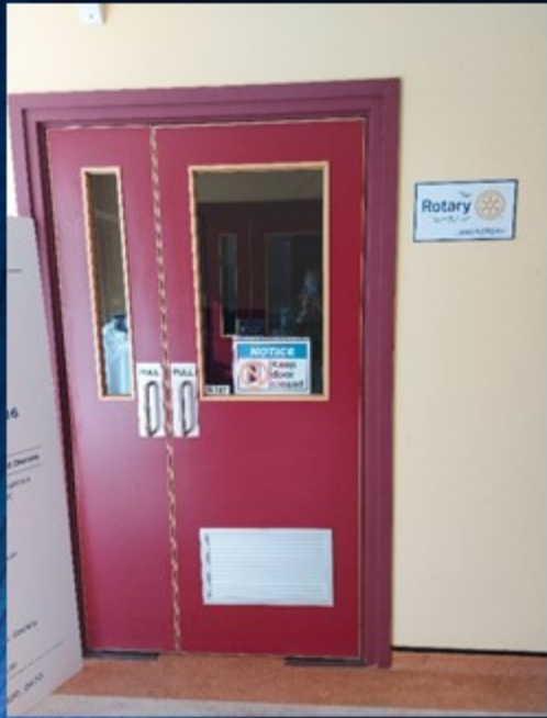
The Rotary Laboratory