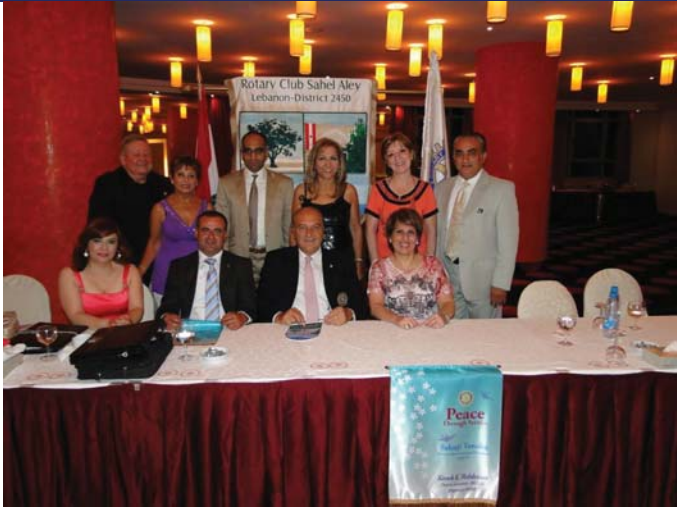
R.C. Sahel Aley