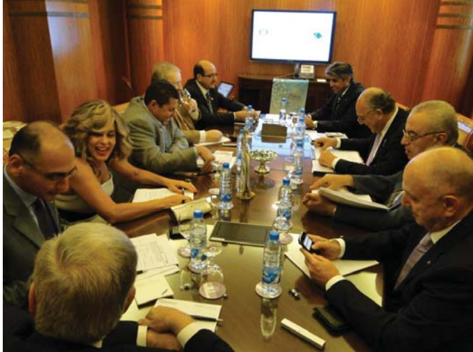
R.C. Beirut Cosmopolitan - Meeting