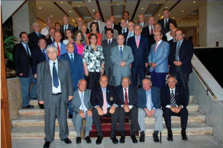
R.C. Beirut - Lunch gathering