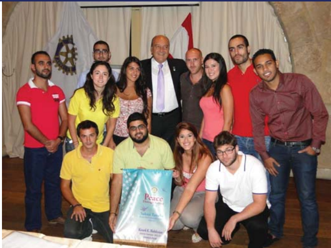
R.C. Byblos Jbeil - Rotaractors