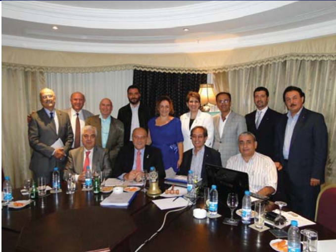
R.C. Baabda - Meeting