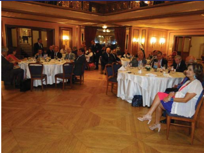
R.C. Beirut - Lunch