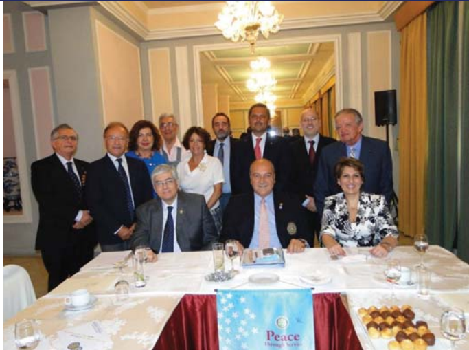
R.C. Beirut - Meeting