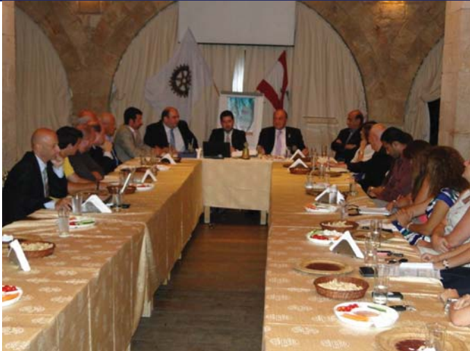
R.C. Byblos Jbeil - Meeting