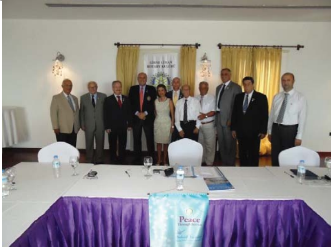
R.C. Kyrenia Liman