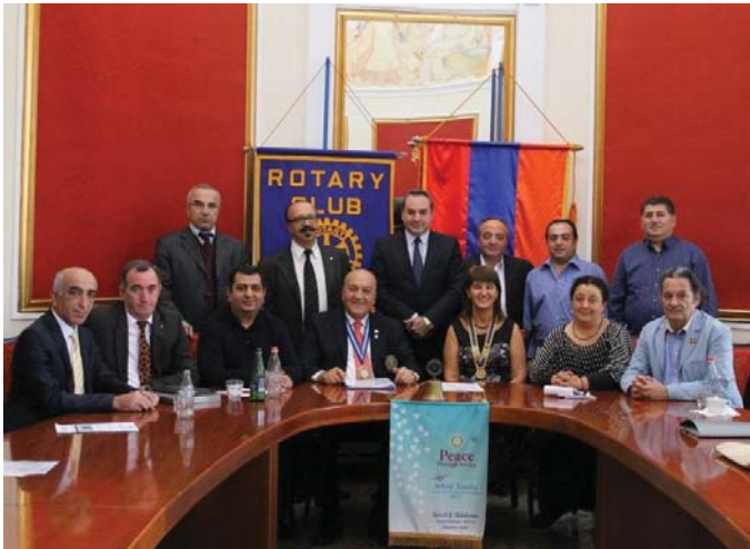
R.C. Yerevan - Meeting