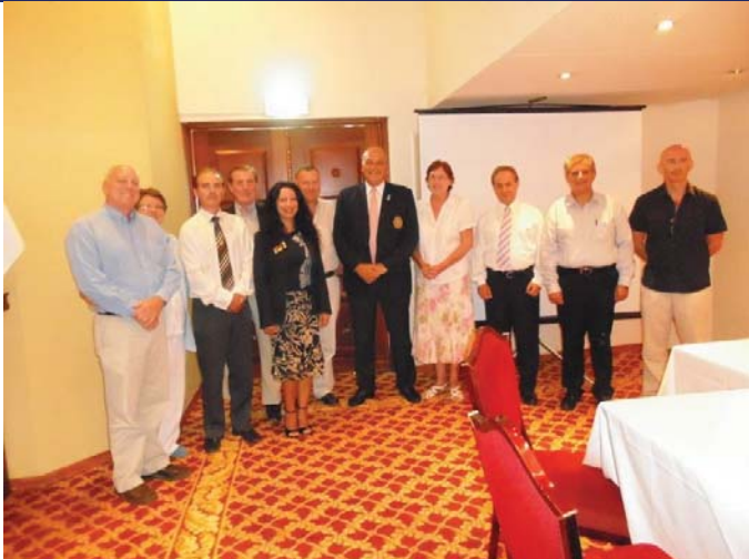
R.C. Limassol Berengaria