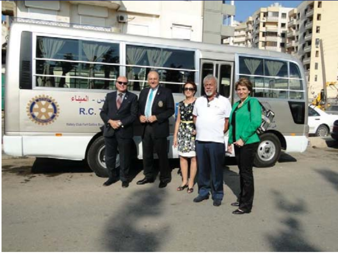
R.C. Tripoli Elmina - Project