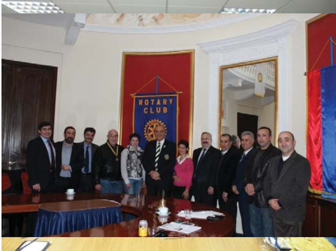
R.C. Yerevan International - Meeting