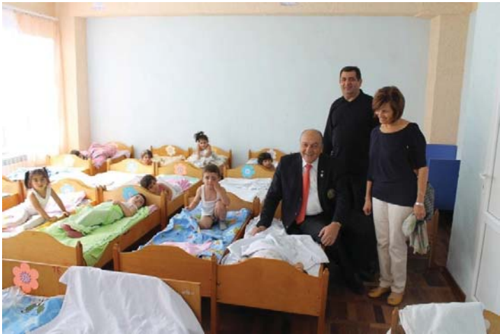
R.C. Yerevan - Project