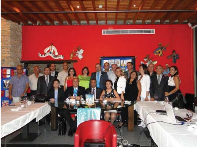
R.C. Zgharta - Zawie