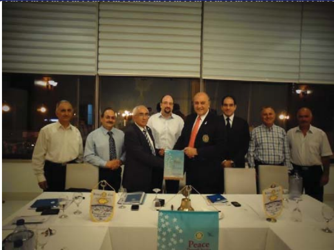
R.C. Larnaca - Meeting