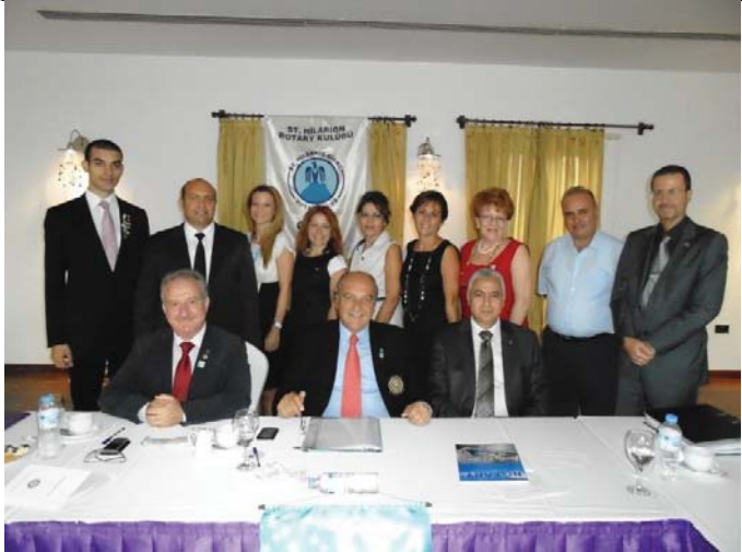
R.C. Kyrenia St Hilarion