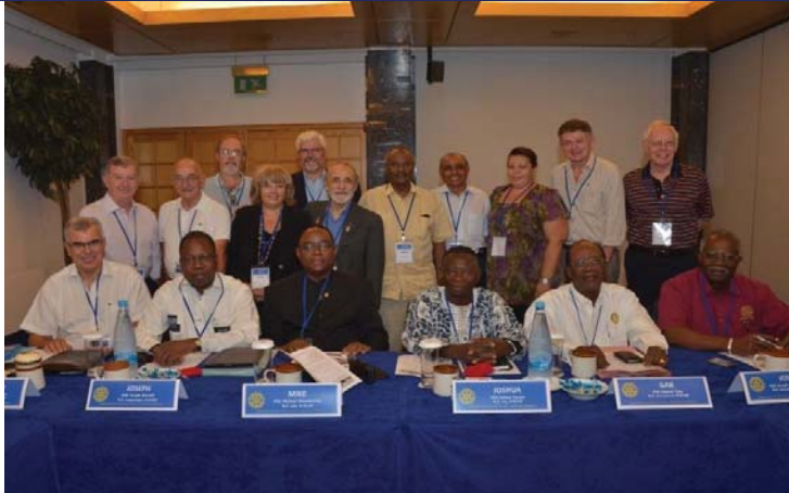
Selection of Director for Zone 20 A+B / Limassol