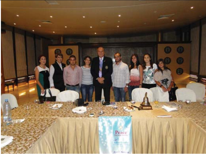
R.C. Tripoli - Rotaractors