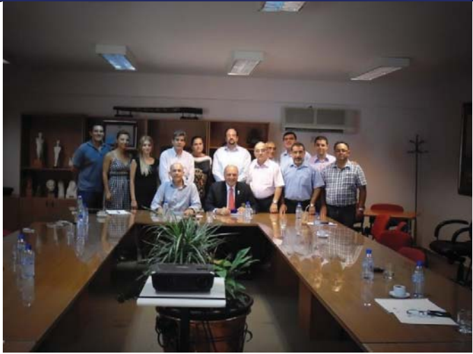
R.C. Larnaca Kition - Meeting