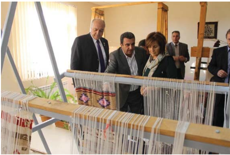
R.C. Gyumri - Project - Arts & Crafts College