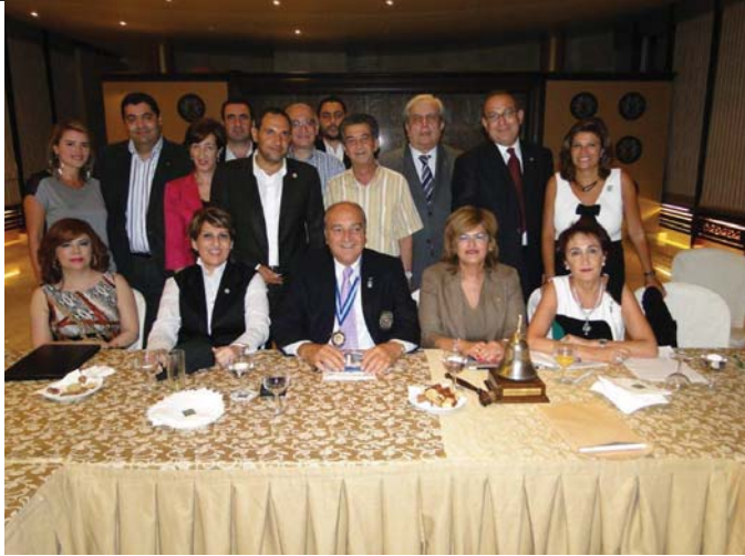
R.C. Tripoli - Meeting