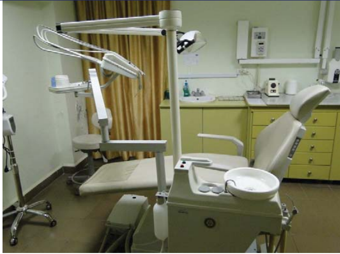
R.C. Tripoli Maarad - Project