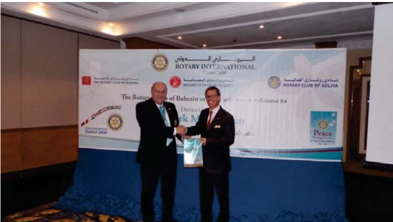
RC Manama / Bahrain - Exchanging banners