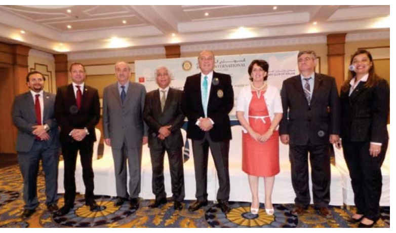
RC Adlia / Bahrain - Committee Members