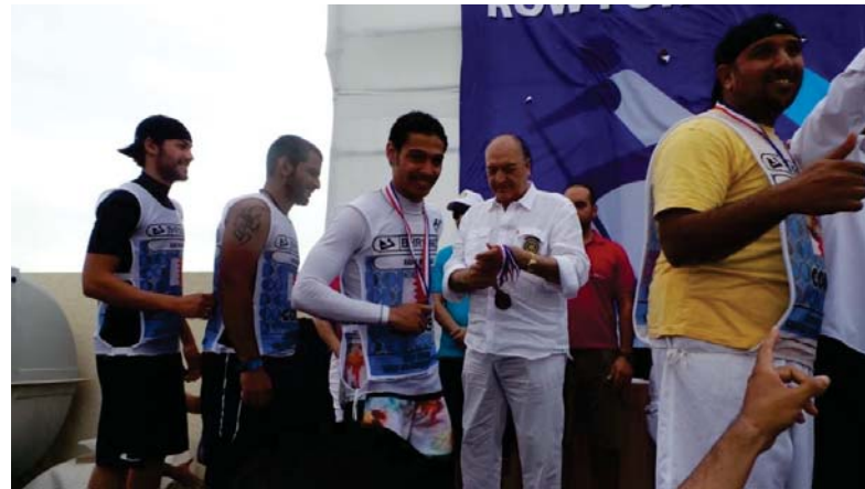
Raft Race 2013 / Winners receiving metals