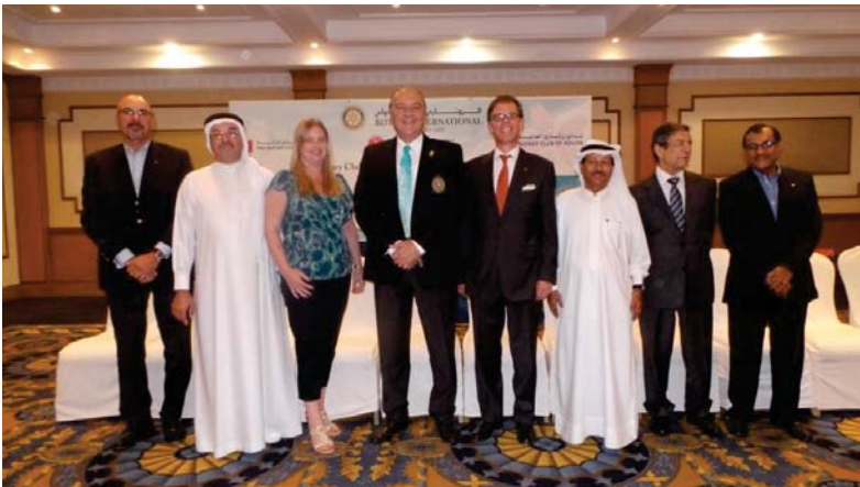
RC Manama / Bahrain - Committee Members