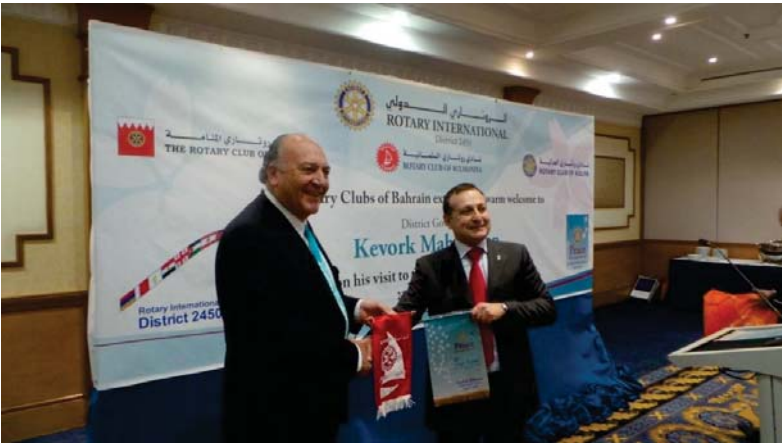
RC Sulmanya / Bahrain - Exchanging banners