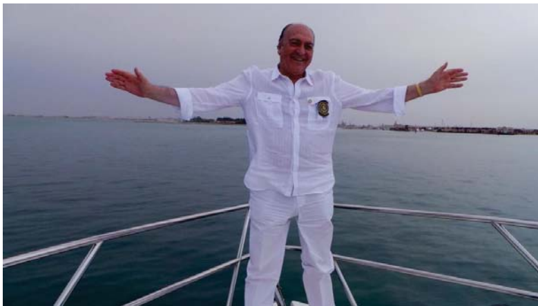
DG on Samahiji "Titanic" in Bahrain