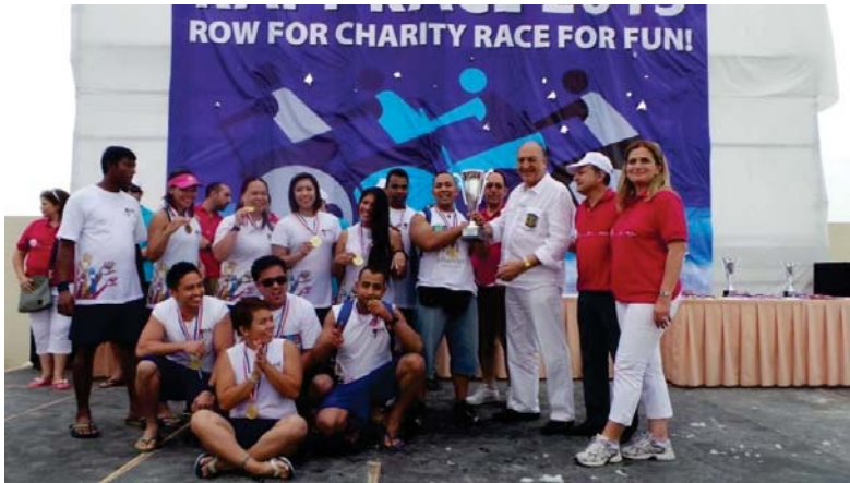
Raft Race 2013 / Award winners