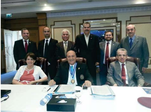
RC Adlia / Bahrain