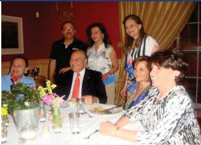
Party in honor of DG and spouse at PP Mazen Al Umran residence