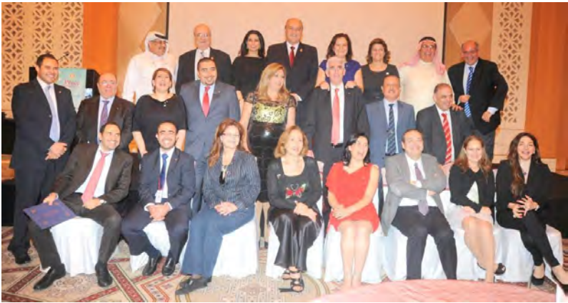
District TRF Seminar - Lebanese Rotarians