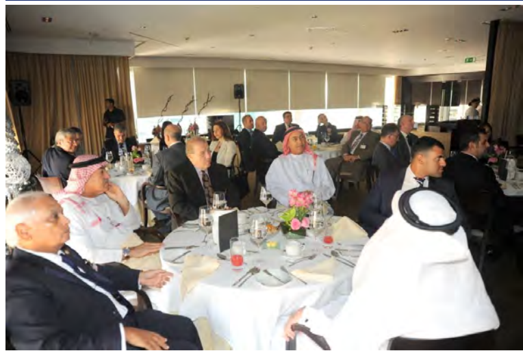
R.C. Dubai Lunch Meeting