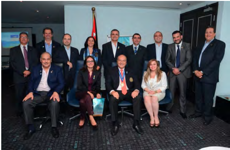
R.C. Amman Jerash - Meeting