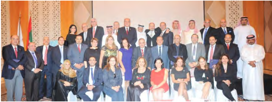
District TRF Seminar - Dubai