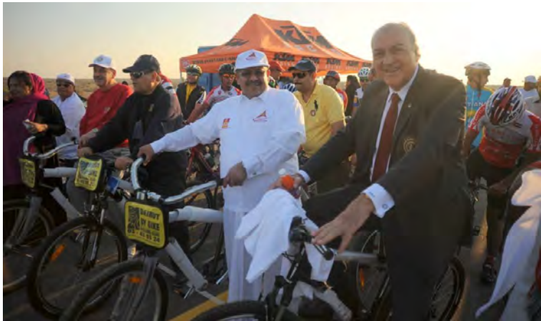
Bike Ride Fundraising for Polio Plus - R.C. Dubai