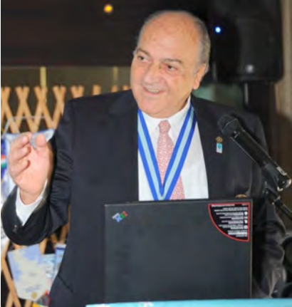
R.C. Dubai Lunch Meeting