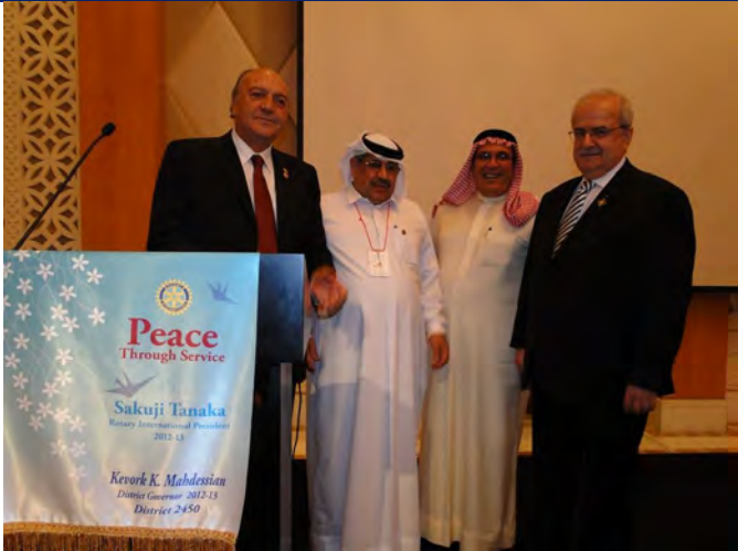
District TRF Seminar - Dubai