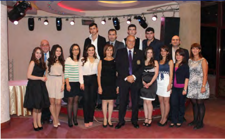
Governor and Spouse with Rotaractors of R.C. Yerevan International