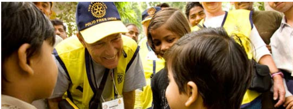
Vaccination Day in India

Is easy to donate – through Rotary web wages wherever se this sign →