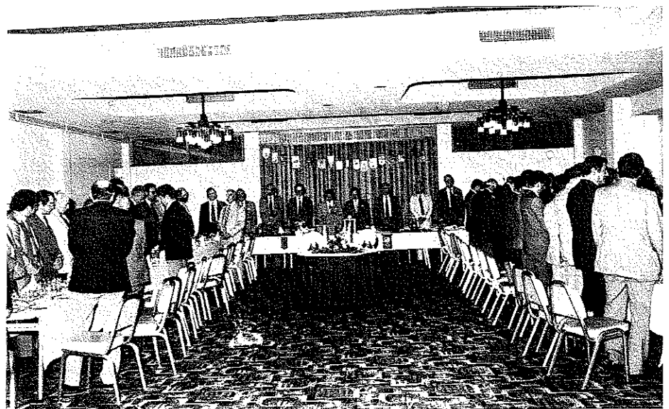
A general view of the first meeting of the new Rotary Club of Nicosia - Ledra.