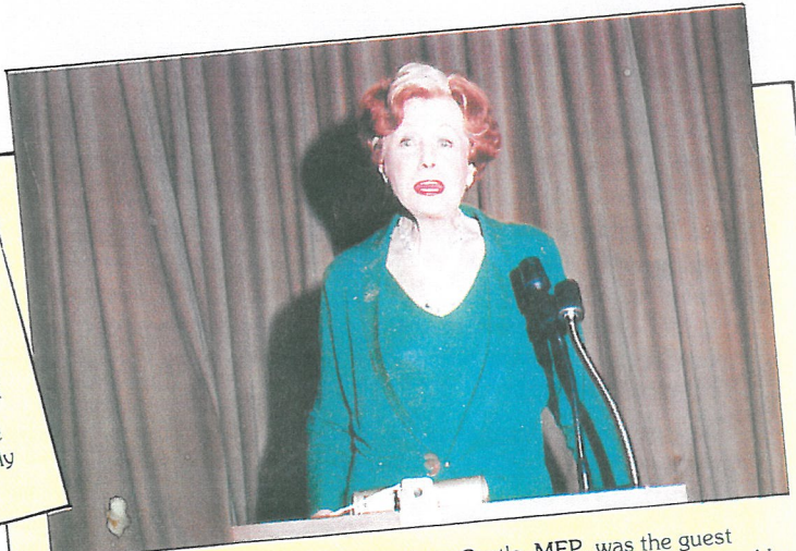
The Right Honourable Mrs Barbara Castle, MEP, was the guest speaker during the 1986 Canon Newham Memorial Lecture, organised by the English School Old Boys and Girls Association, in the hotel's Conference Hall. Mrs Castle's subject was "Cyprus and the EEC".