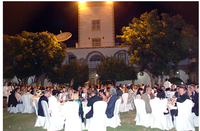
Gala Dinner at Presidential Palace Rotarians, their families and guests