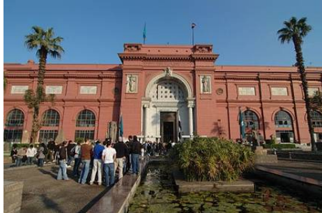
Egyptian Museum, Cairo

ICOM expresses its deepest concern for Egypt's great historical treasures, currently under threat from looting in the wake of recent events that have swept the nation. ICOM urges and encourages local authorities and civil society to pursue their efforts in protecting and safeguarding the invaluable cultural heritage of this country.