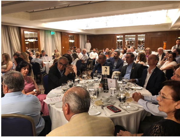
Handover Ceremony Event on the 2 nd July 2019