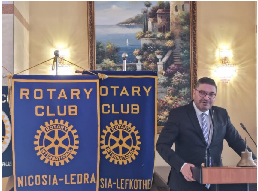
The Minister of Finance, Mr. Constantinos Petrides delivering his speech.