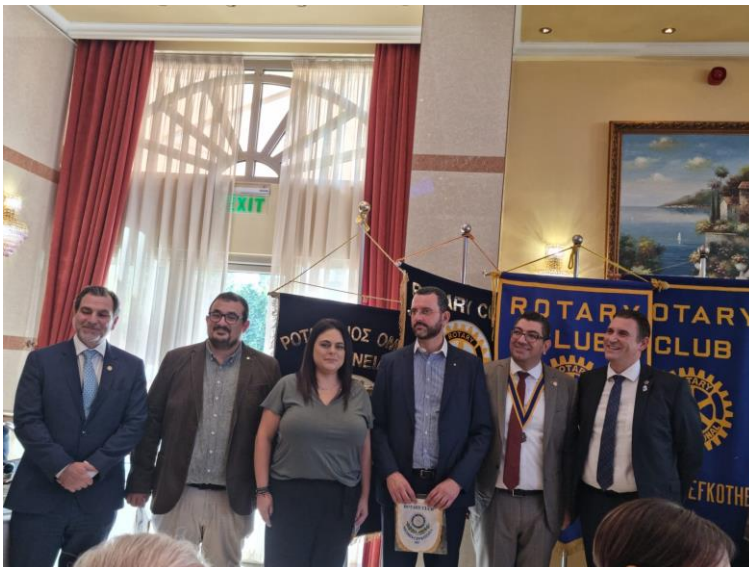
A group photo of the new members with their introducers and the Club President.