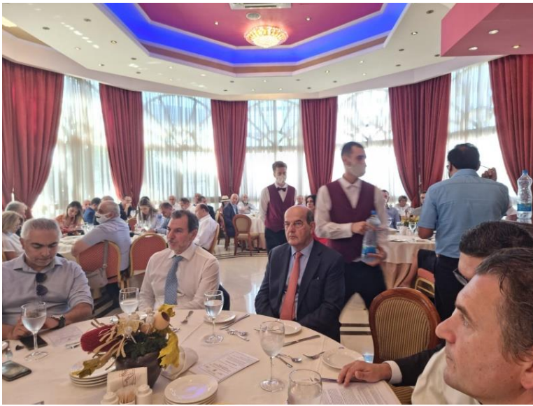
A partial view of the event's attendees.