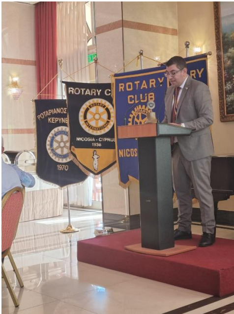
The President of the Club addressing the event