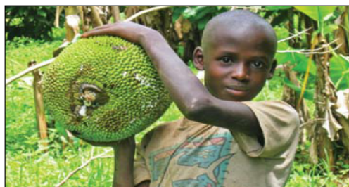
Clubs in Belgium and Uganda are together bringing health and bounty to impoverished villagers.

Sustainability The organizers formed partnerships with Heifer International, Uganda's Ministry of Health, and the Mpigi district and town councils, which pledged to support the project after it