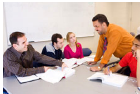
Rotary World Peace Fellows learn Arabic at Duke University. Durham, North Carolina, USA.

Learn more about how you can get involved