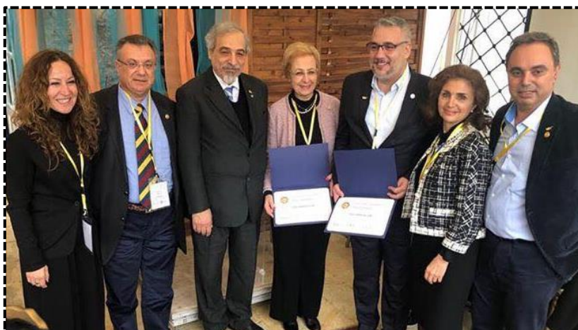
Our club members whom awarded with Paul Harris Fellow award