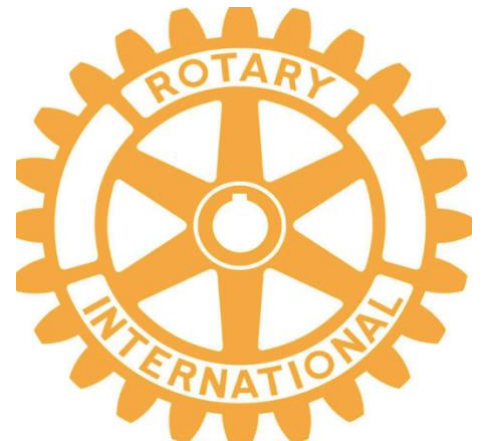
New Rotary International Logo